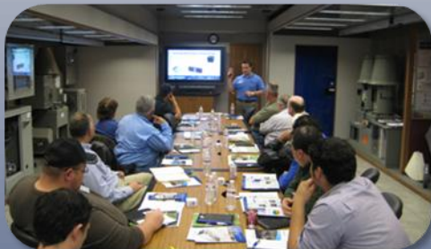
Greenheck Air Tour Mobile Learning Center

Dec. 7 - 11, 2009 —The Greenheck Air Tour Mobile Learning Center traveled to Austin, San Antonio and Corpus Christi. It was utilized to educate participants on the latest advances in the industry, with the most comprehensive selection of air movement and control equipment in the world.